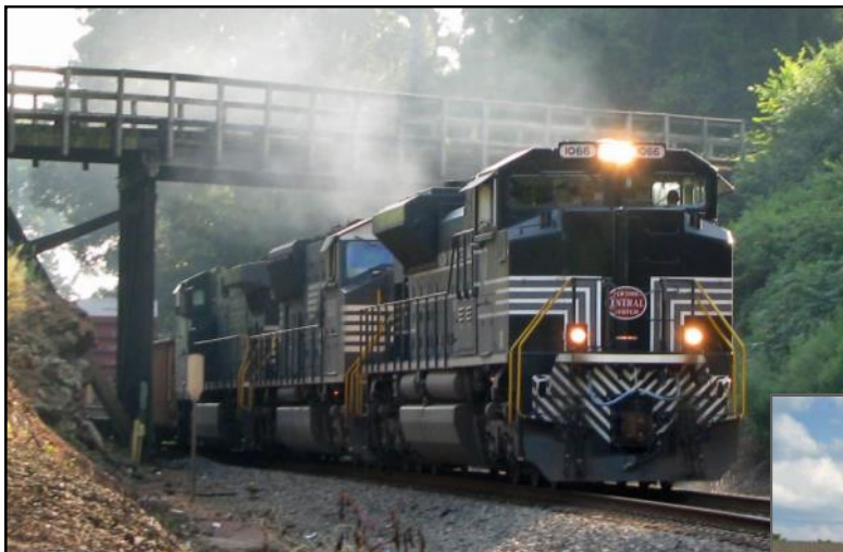
New York Central heritage unit #1066 an SD70ACe passing under the old wood overpass at Duncan.