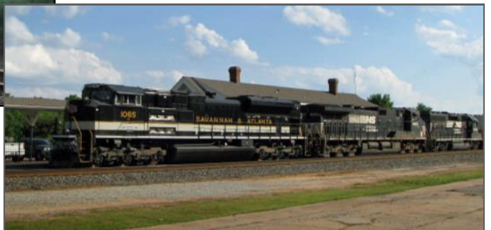
Savannah & Atlanta #1065 an ES44AC, at Magnolia station.