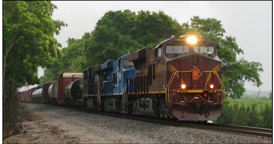
Pennsylvania heritage unit #8102 an SD70ACe with Conrail #8098 an ES44AC at Greer.