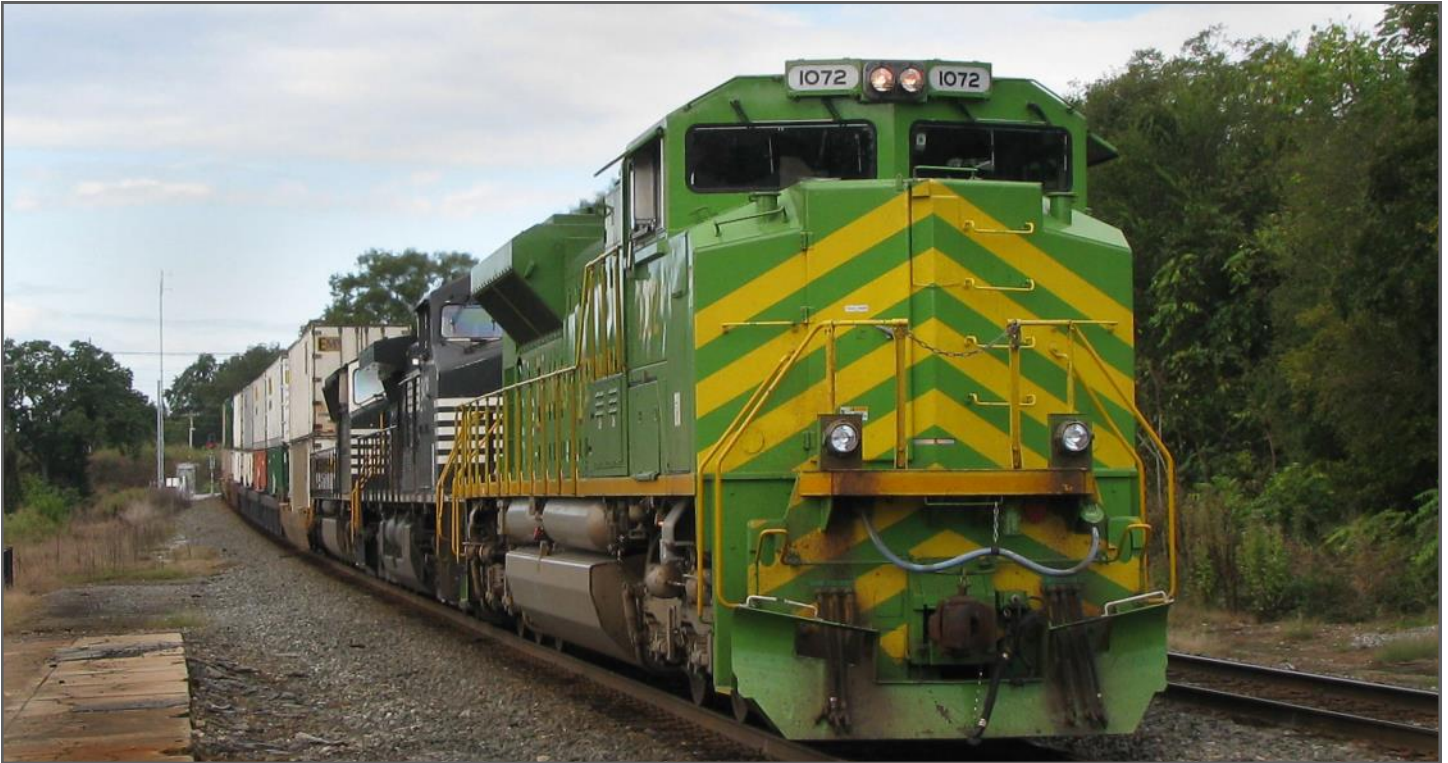
Illinois Terminal heritage unit #1072 an SD70ACe at Spartanburg rounding the curve toward CP Magnolia.