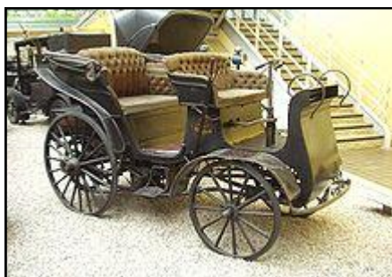
Präsident, the first factory made car in Central and Eastern Europe in 1897.

Tatra is the third oldest car maker in the world after Daimler and Peugeot. Their first gasoline powered automobile was sold in 1897. They had started manufacturing horse drawn carriages in the 1850's, and didn't cease production of those until the 1920's.