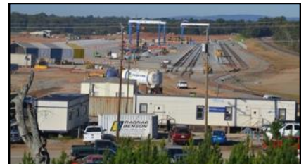
SC Inland Port under construction circa November 2013.