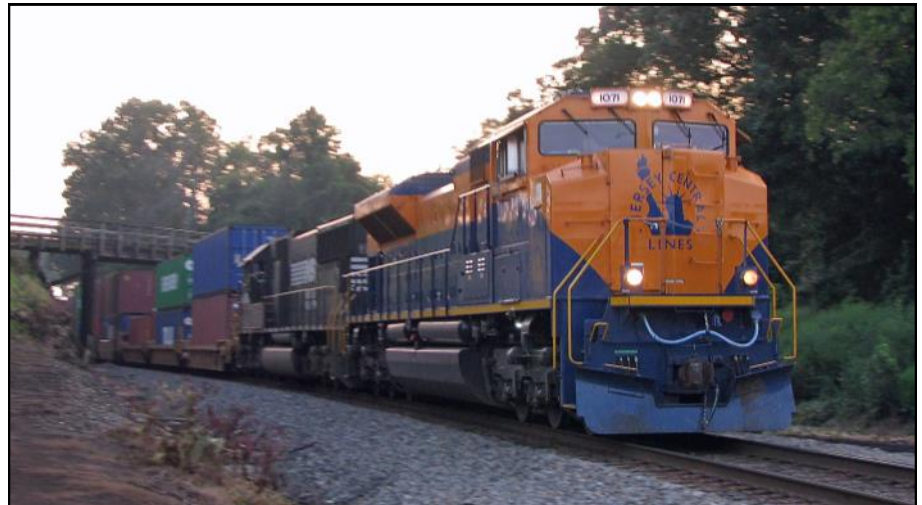
New Jersey Central #1071 an SD70ACe.