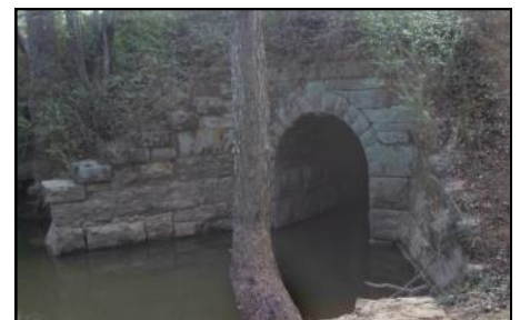
Stone culvert under the old Southern Railway line near Piedmont, S.C., believed to have been built in the 1850's.