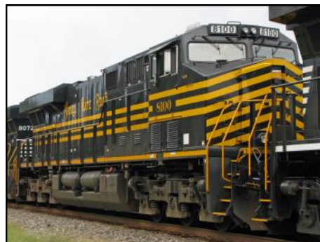
Nickel Plate #8100 an SD70ACe.