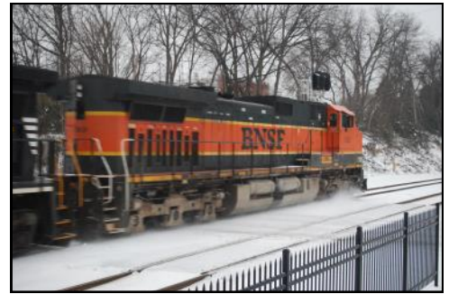
NS freight at Spartanburg by Frank Ezell.

billion capital spending this year. The bulk of the '15 expenditures will go to replacing and upgrading rails, ties and other track components, the company said. The railroad will add 330 new locomotives to its fleet of 7,500.