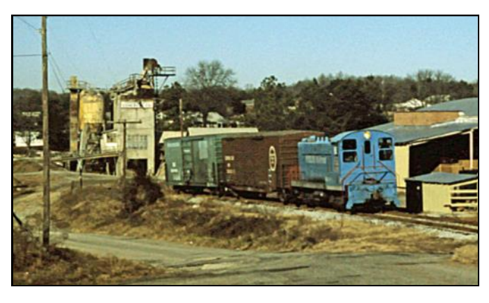
Above: 1979 view of the PICK train near the concrete plant in Easley. Below: 2015 view of the new Doodle Trail at the concrete plant.

May 1, 2014, a master plan for the trail was discussed at a public meeting. In December 2014 King Asphalt Inc. won a contract for $1.9 million to design and build the trail, 7.4 miles long. This was shorter than the 8.5-mile former right-of-way because the trail in Easley started at Fleetwood