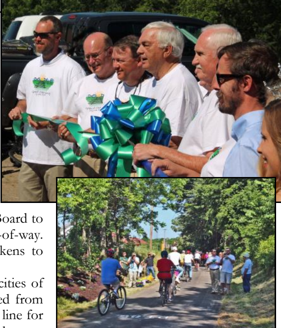
Continued on Page 5 - Doodle Trail