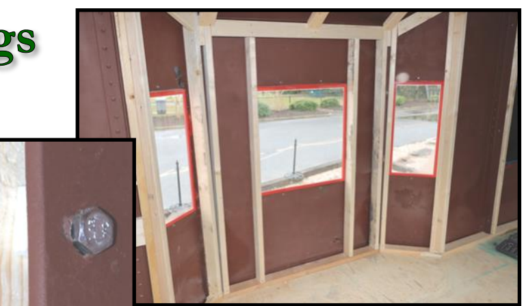
↑ No nails used in construction. White plastic spacer to keep wood away from metal.